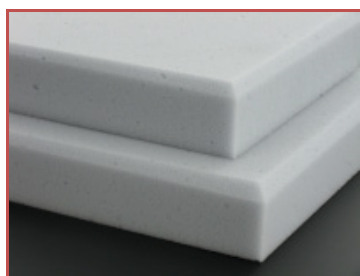
Lateral view (plates with chamfers)

Chamfer (optional) 5x5mm = 4.00 €* for a 1,250x1,250mm plate (on the plates' outline)